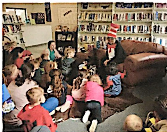
Dr. Seuss Read Across America Day