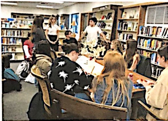
High School Peer Tutors